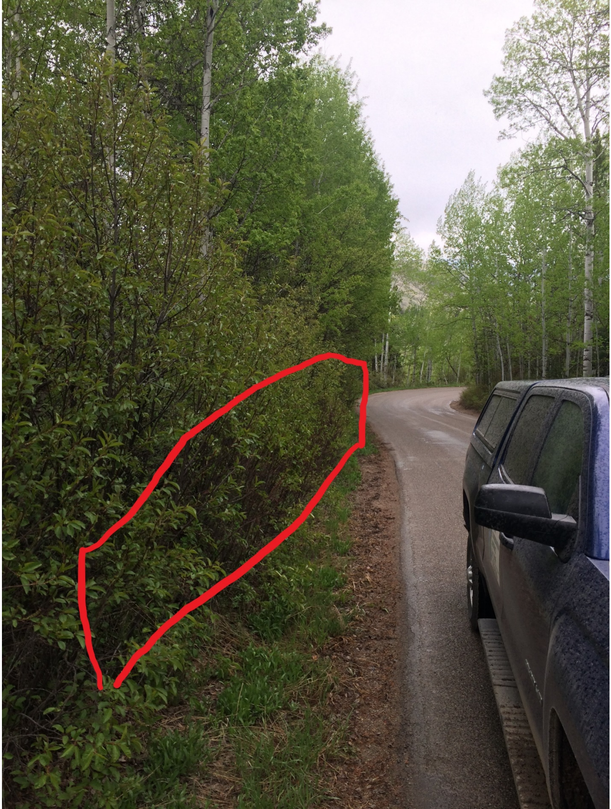
Figure 7. Recommend pruning back live and dead shrubs, in the area six feet out from the edge of the paved surface.