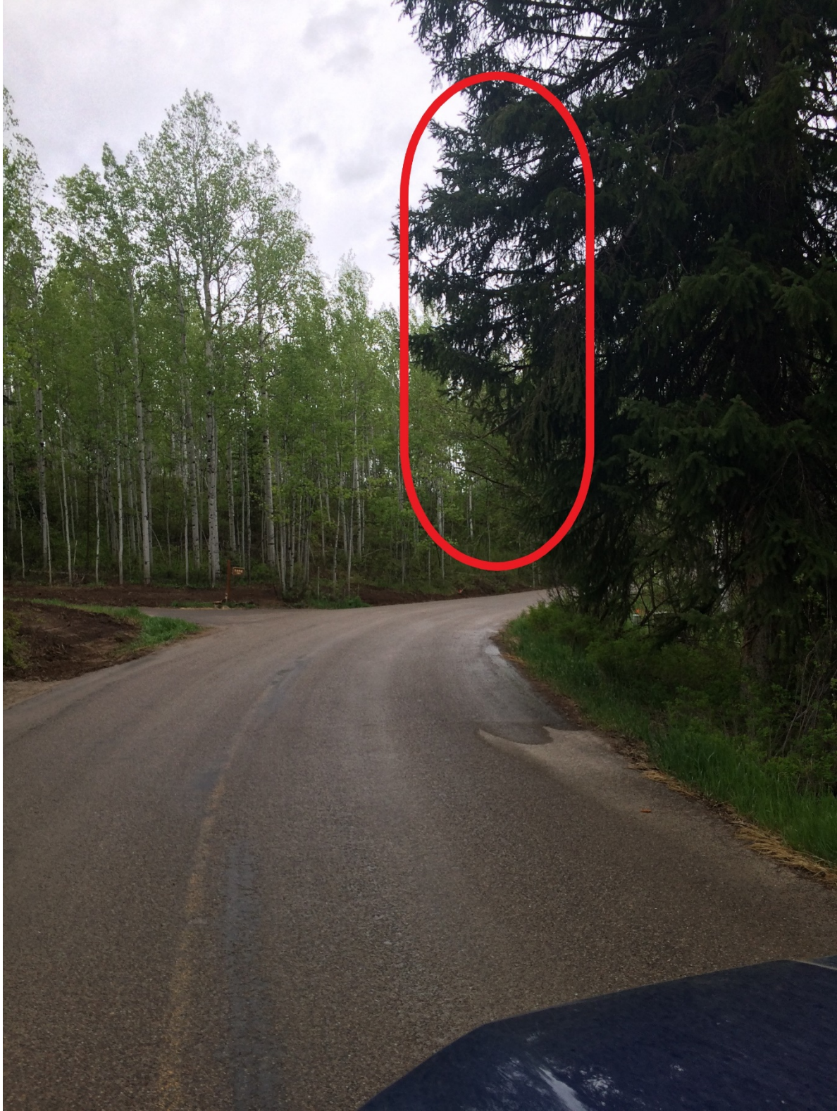
Figure 5. Recommend pruning back limbs of conifers that encroach into the road corridor, such as the area outlined in above photo.