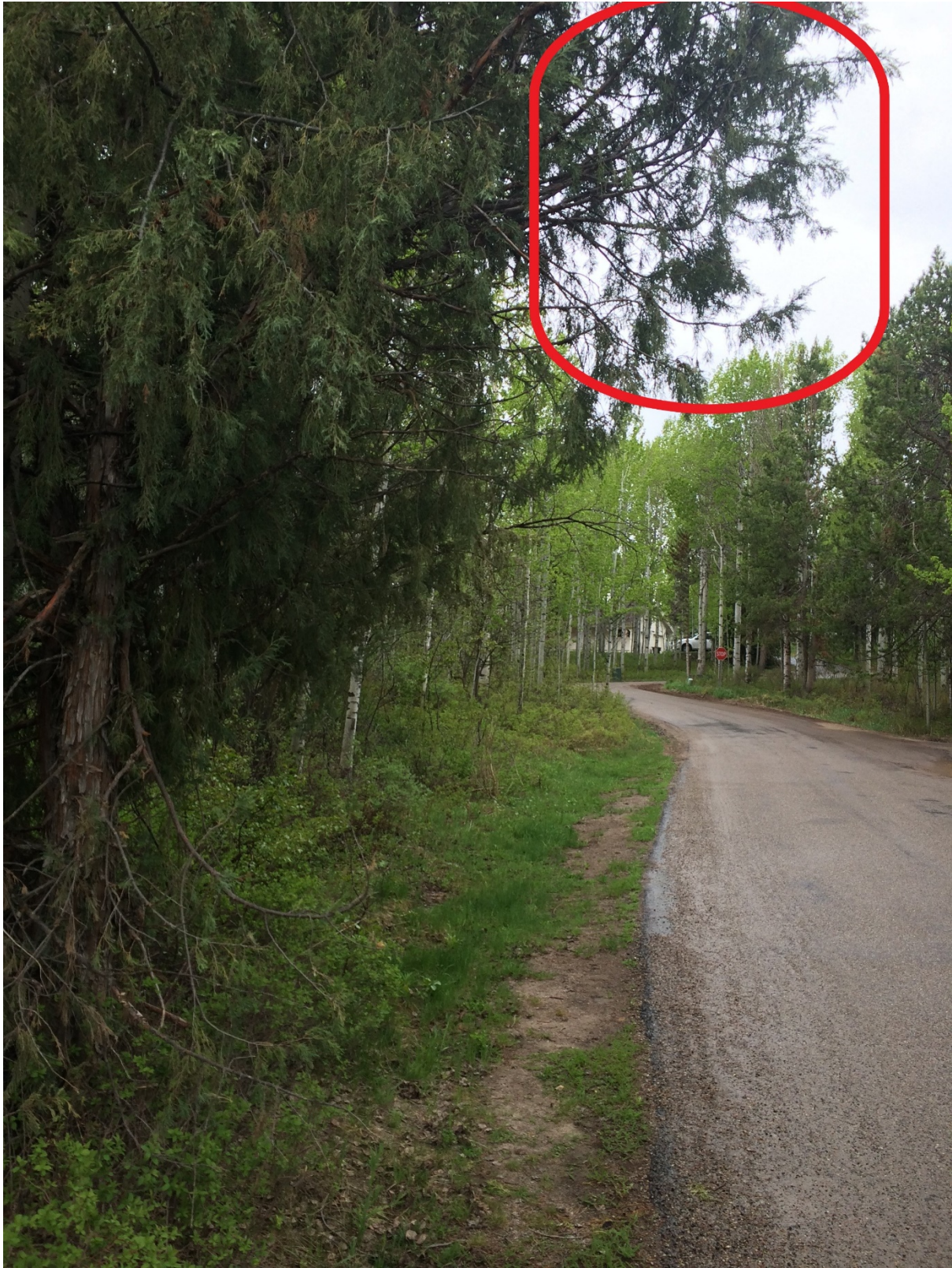
Figure 3. Recommend pruning back limbs of this juniper.