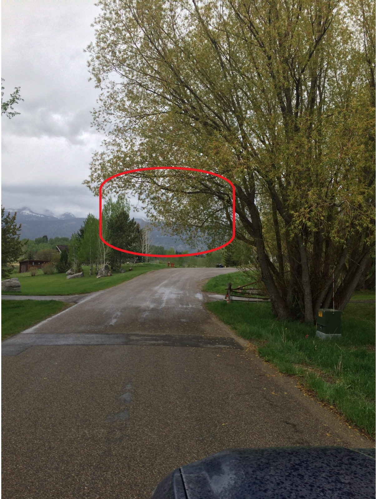
Figure 8. Recommend pruning back limbs encroaching in the road corridor, such as the limbs outlined in this willow.