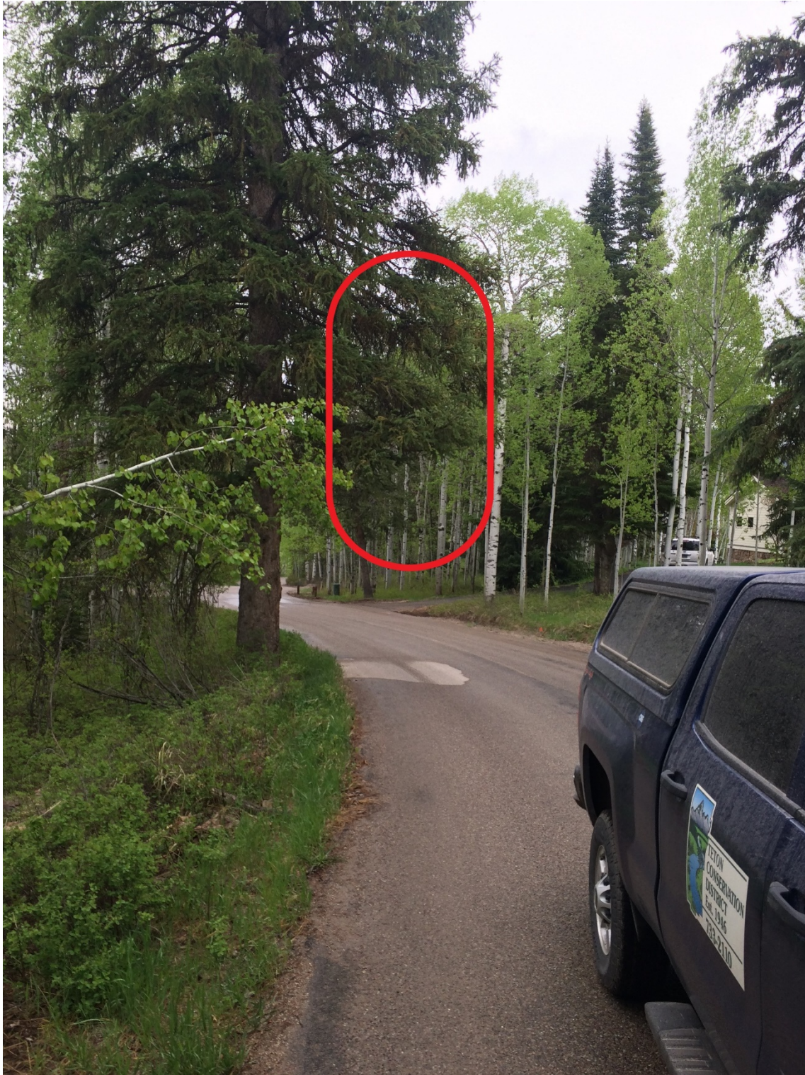
Figure 6. Recommend pruning back conifer limbs encroaching in the road corridor, such as the outlined area in photo above.