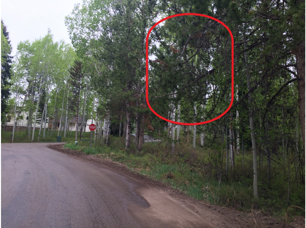
Figure 2. Recommend pruning back limbs from the annotated conifer (and all comparable areas) that encroach into the road corridor.