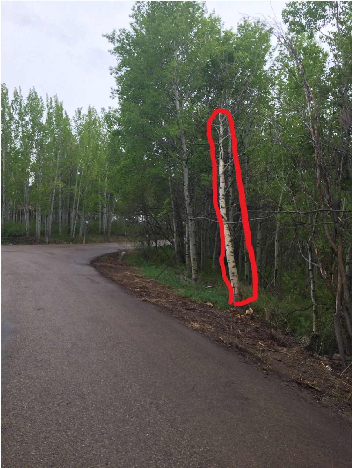
Figure 4. Recommend remove dead trees from the road corridor, including (but not exclusive to) the outlined aspen.