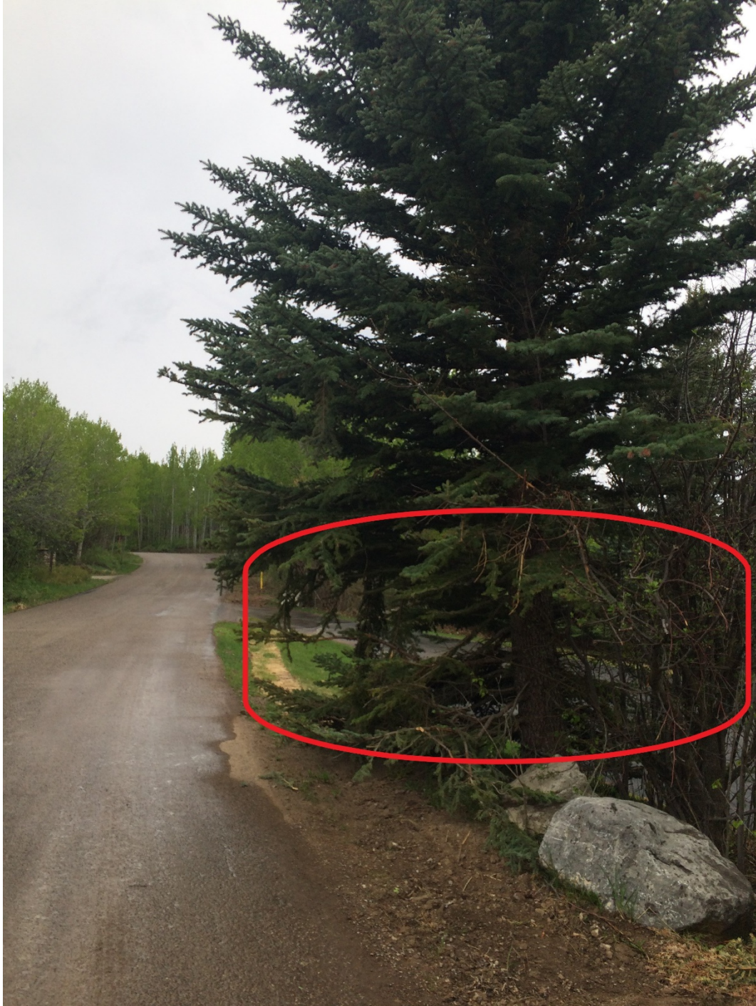
Figure 10. Recommend raise pruning the lower limbs of the conifer in photo above.