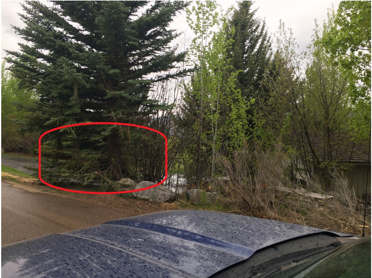
Figure 9. Recommend raise pruning (removing all live and dead lower limbs) six feet above the ground surface, for this large conifer at the corner of the driveway and road.